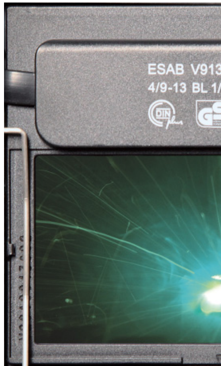
STANDARD ADC PLUS SIZE