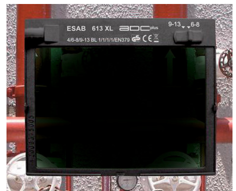
XL ADC PLUS CARTRIDGE