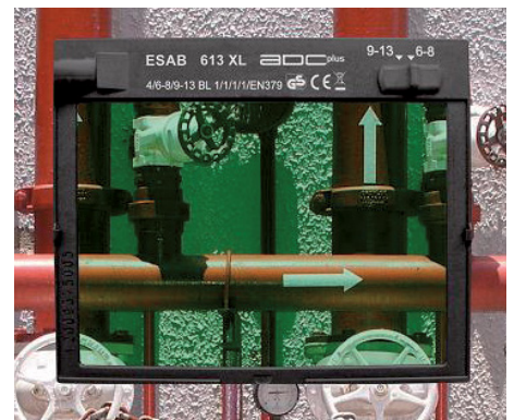
XL ADC PLUS CARTRIDGE