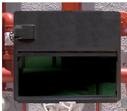
STANDARD NON ADC PLUS CARTRIDGE

The benefits – an increased shaded area that covers the height and width of the cartridge, whilst reducing bright visible light.